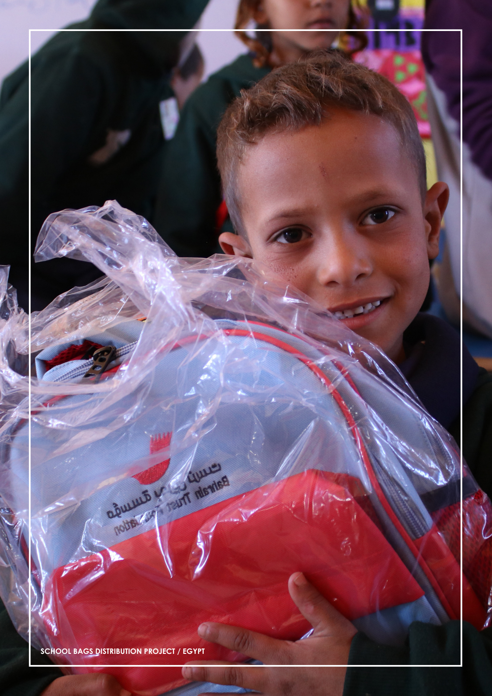
SCHOOL BAGS DISTRIBUTION PROJECT / EGYPT