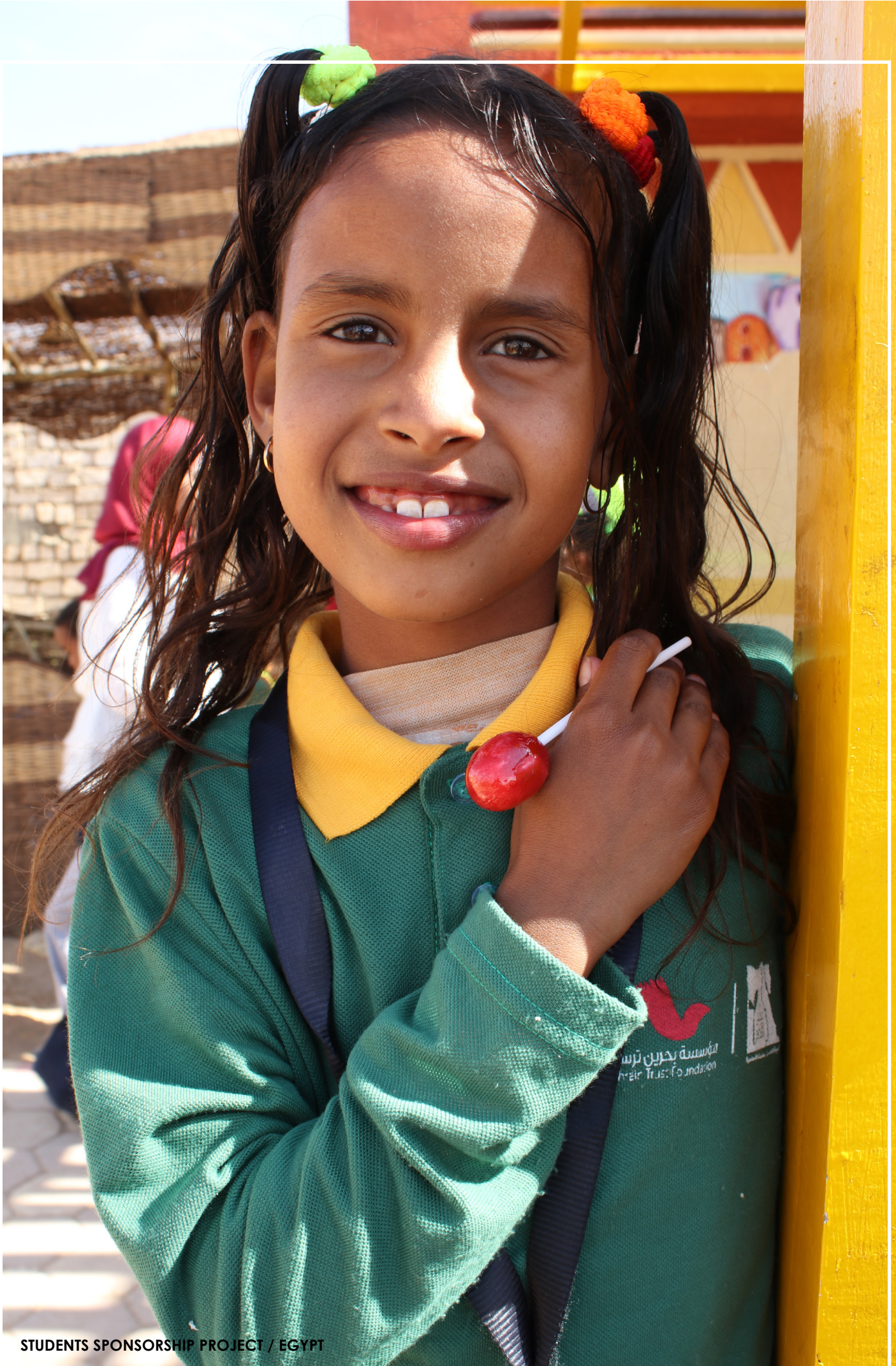
STUDENTS SPONSORSHIP PROJECT / EGYPT